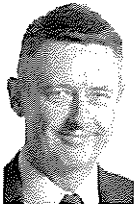
Tauranga Mayor Stuart Crosby

The council also agreed to support making a cornerstone grant of $950,000 in the 2017-18 financial year as a contribution to construction costs - subject to approval of the project's business case.